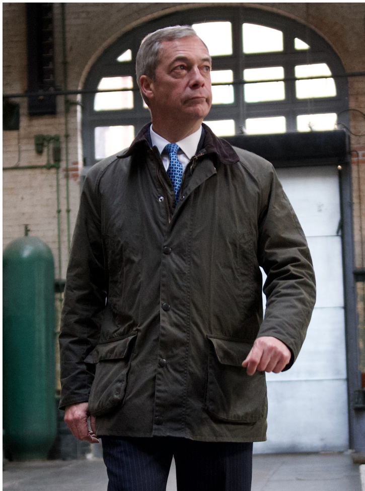
NIGEL FARAGE Leader of The Brexit Party