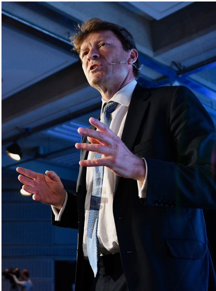
RICHARD TICE Chairman of The Brexit Party